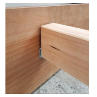
Centre Rail in place