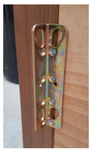
Bracket on Headboard and Tail Board