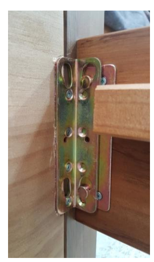
Example of Side Rail bracket attached to Headboard bracket