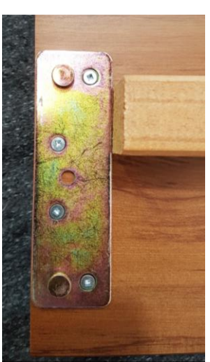
Bracket on Side Rails