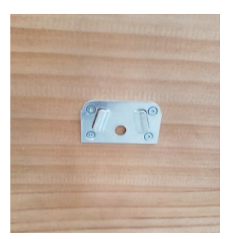
Centre Rail Bracket